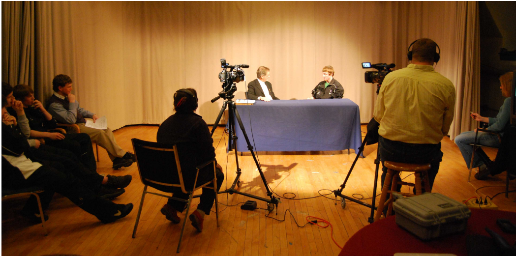
Left: Crew members behind the scenes at a studio shoot.